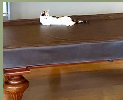
Lil Bit - the Queen