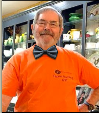
Ready for "black tie" event